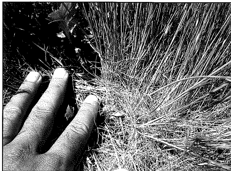
Figure 2. Recently germinated Clarkia davyi seedling underneath dense exotic grass cover at Younger Lagoon Reserve (Case Study 3).

In the greenhouse, most species had germination rates >50\% ; however, Symphyotrichum chilense and Juncus patens had very low germination (Table 3). Two forb species, Trifolium willdenovii and S.