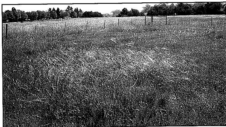
Figure 1. UCSC experimental plots from Case Study 1. Note Stipa pulchra , one of the few species that established from seed.

Of the six species seeded in 2009 and 2010, only half established in the field experiments (Table 1) and only one ( Madia sativa ) had a yield rate (number of seedlings per number of seeds) of >0.1%. Viability was not likely to be the limiting factor in this case, as 11–82% of the seeds germinated in the greenhouse (Table 1). Rainfall was below average in fall 2009, whereas rainfall was well above average throughout the 2010–2011 growing season.